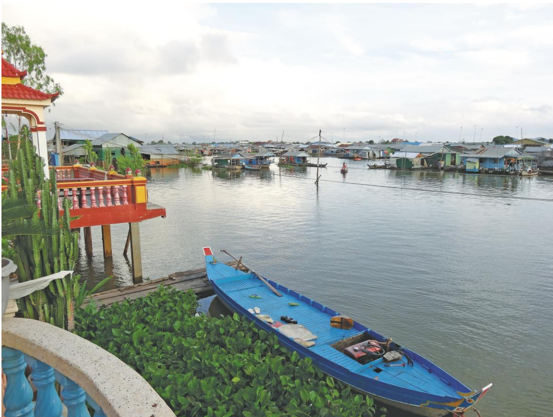
Kandal village in rainy season

During four field trips between November 2013 and March 2014, Kdei Karuna has conducted life story interviews with 33 respondents aged between 49 and 83. During the trips, the research team stayed in the villages for several days and took part in the communities' everyday life. We delved into the past of our narrators, explored the stories that were passed down from their parents and grandparents and discovered what life was like before their total expulsion in 1975.