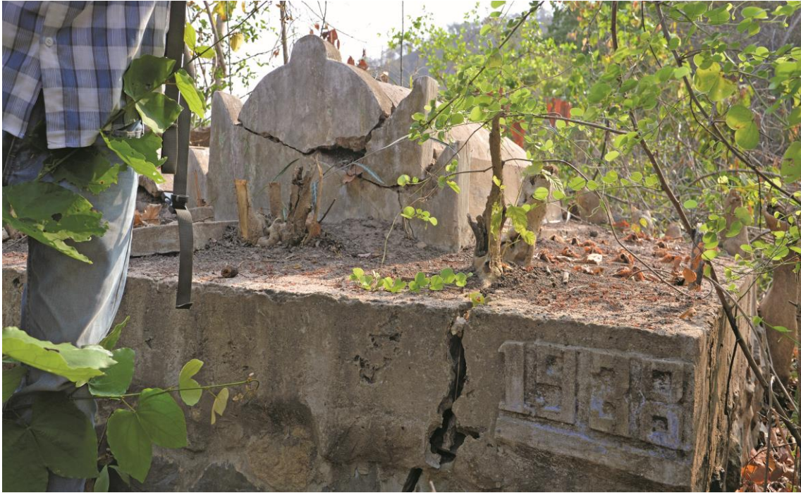
Grave from 1938 in Sâmbraong village

We embarked on a journey into the past with some of the elders from Kandal and Chong Koh village and explored their memories, traditions and historical places. We came across some remnants of the time such as the gate of an old Vietnamese pagoda at the foot of the Neang Kangrei Mountain and old graves, the oldest one dating back to 1938. The elders vividly recalled stories from their childhoods and the life in the villages before 1975. They described their native villages and the families' struggles to make a living and pay their regular immigration fee.