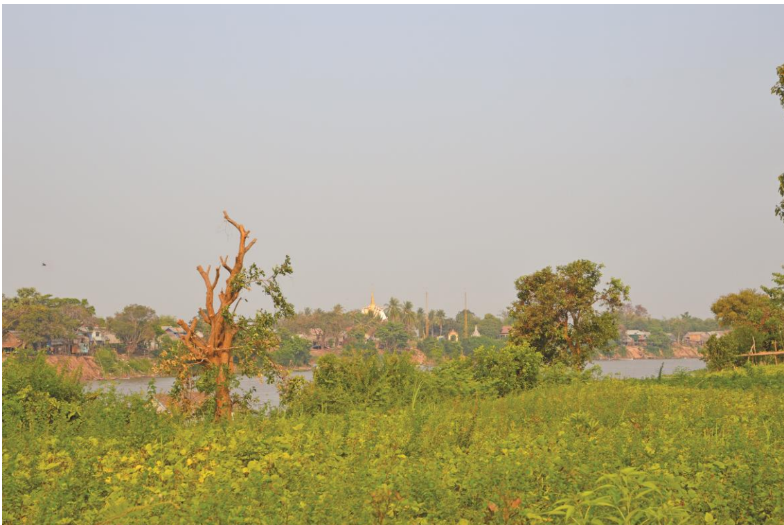
View of Brâlai Meas from the east bank