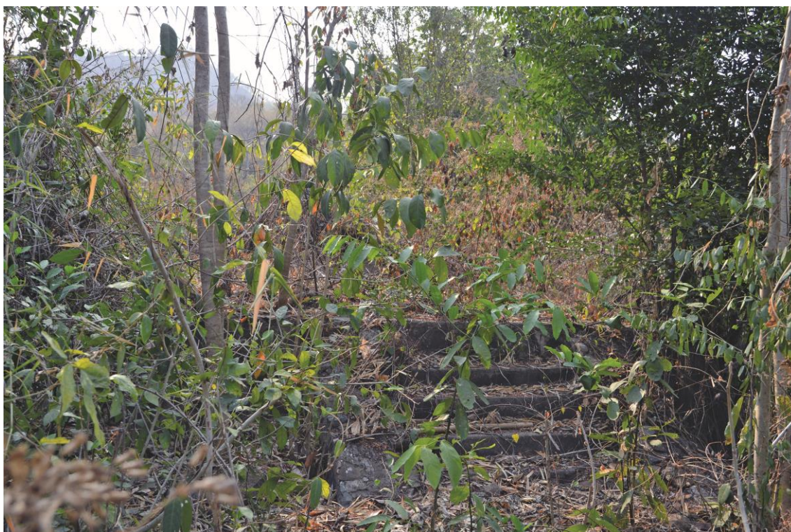
Presumably the remains of the Vietnamese pagoda in Sâmraong village

In Sâmraong village, 15 to 20 Vietnamese families lived in the direct vicinity of a pagoda at the foot of Neang Kôngrei Mountain around 3 km north of Peam Talea on the other side of the lake. The pagoda was run by Vietnamese monks. Next to it was a Pali school with at times more than 200 students. According to grandfather Chang Yang Long, Sâmraong village was home to about 200 families, most of them Khmer. Both, Vietnamese and Khmer families lived in stilt houses on land because of the regular flooding. Only the pagoda was located high enough and spared from flooding. Chang Yang Long's, older sister, Grandma Chang Thinhang, recalls that in their childhood they often played with the neighbors' children – no matter which ethnicity. They were fluent in both languages. The only difference was that the Vietnamese families were fishermen, while the Khmer families grew vegetable and rice. There was no market in Sâmraong village and when people wanted to buy pork, for instance, they had to go to Kampong Boeung village, more than 6 km away, near the district town of Kampong Leng. There was also a ferry to Kampong Chhnang town or to Kampong Chen.