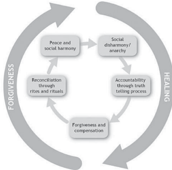
The traditional justice cycle

The traditional justice cycle provides a quick snapshot of how simple, though complex, the process might be.