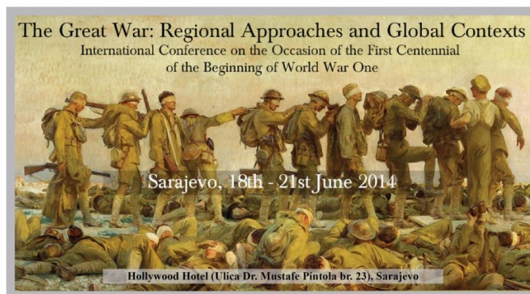
„The Great War: Regional Approaches and Global Contexts“, international historians' conference in Sarajevo, 18th-21th June