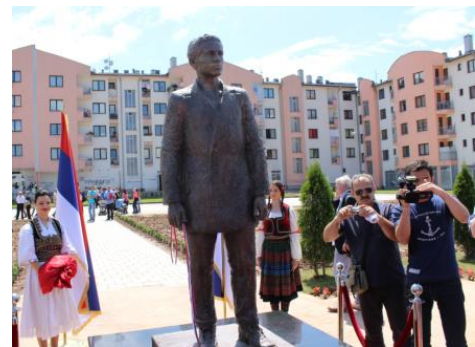
Inauguration of the Gavrilo Princip monument in East-Sarajevo

of that monument and thus made it clear that it was not sure of its own perception and vision of Bosnia and Herzegovina. It is a paradox that, at the same time - commemorating the 100th anniversary of the Great War - the Vienna Philharmonic performed in Sarajevo, Eastern Sarajevo organised the event called "The 21st Assembly of Gusle Players of Republika Srpska". This indicates that there are deep divisions in the society and that there are some people who are trying to deepen them even further. And Europe is sitting and watching it!