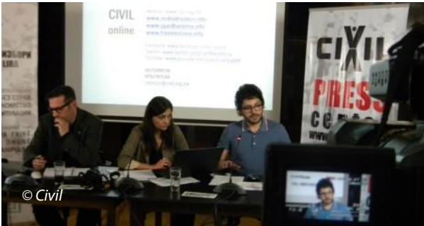
Civil press conference launching the report "Elections 2014: Democracy Disqualified" in Skopje

Dealing with the past became a central topic for Civil in the past several years. This is important for a society which often lives in and suffers from the past, due to