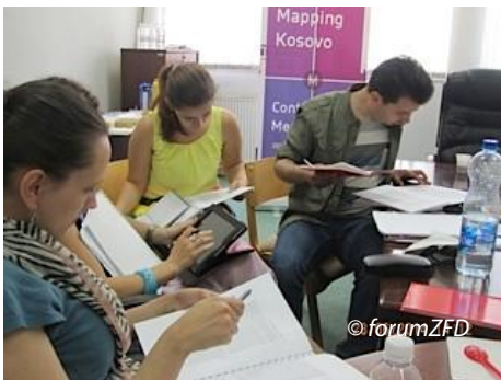
Some of the participants at work

"Memory Mapping Kosovo" aims at identifying, analyzing and scrutinizing alternative and official but contested memory sites in Kosovo. By contrasting them with