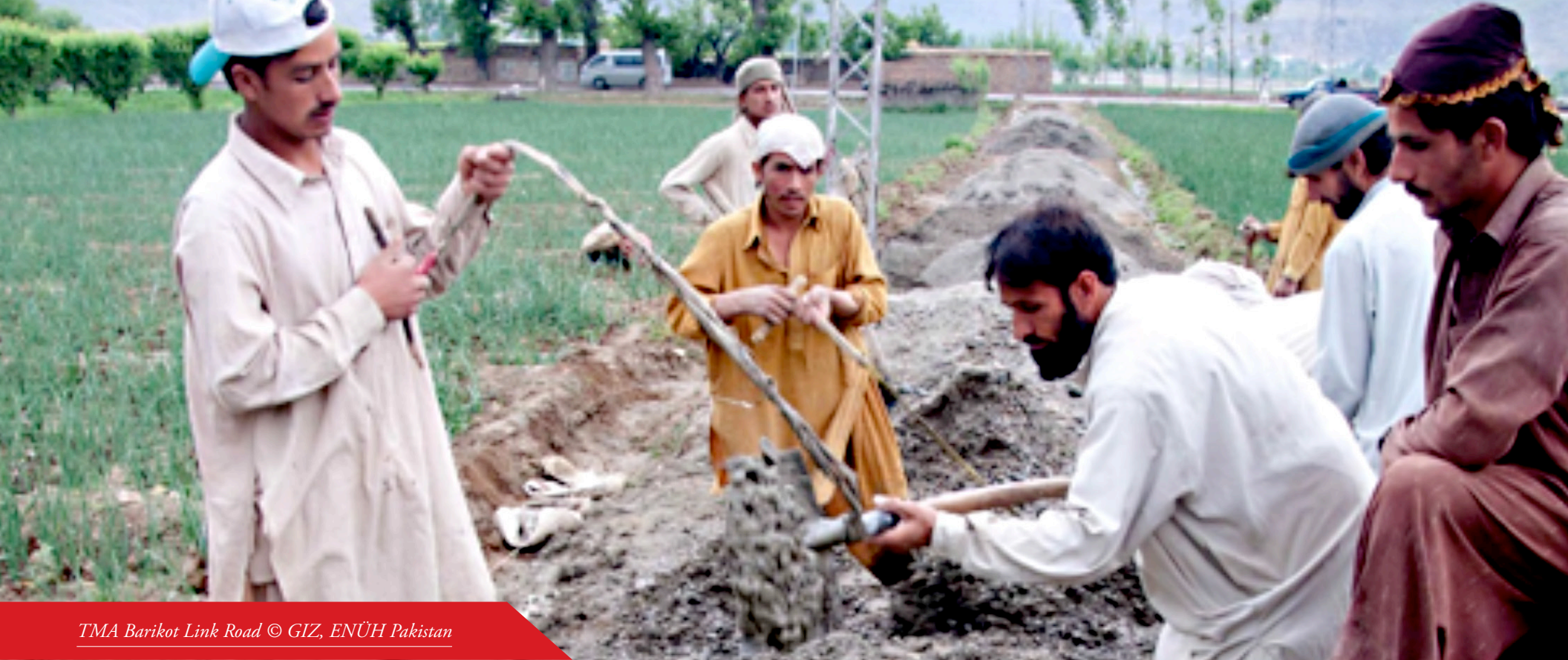
TMA Barikot Link Road