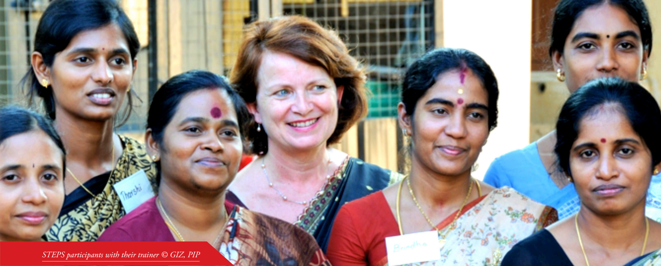
STEPS participants with their trainer

financial support provided by the commissioning party – not withstanding their legitimate request and need for evidence-based results.